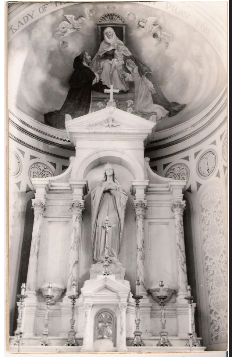
Painting at St. Ann - Side altar

Join us online to pray the Rosary at 6 pm on Facebook of Holy Cross Family Ministries - Canada